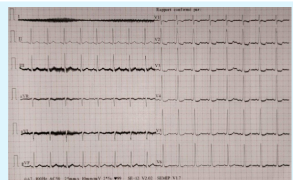
Figure 2. Electrocardiogram after termination of atrial fibrillation episode with oral loading single dose of flecainide (300 mg) revealed the presence of a left-sided accessory pathway

Blood samples showed normal thyroid-stimulating hormone (TSH) levels. Oral flecainide at a daily dose of 150 mg (prolonged-release capsules) was started and maintained at this dose until delivery.