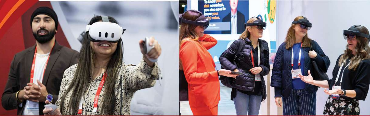
Exhibit at #AHA25