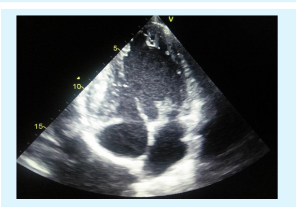
Figure 3. Double-inlet single ventricle