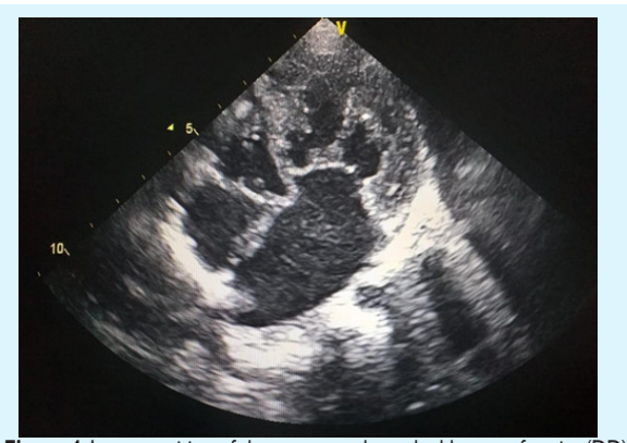
Figure 4. L-transposition of the great vessels on double unconformity (DD)